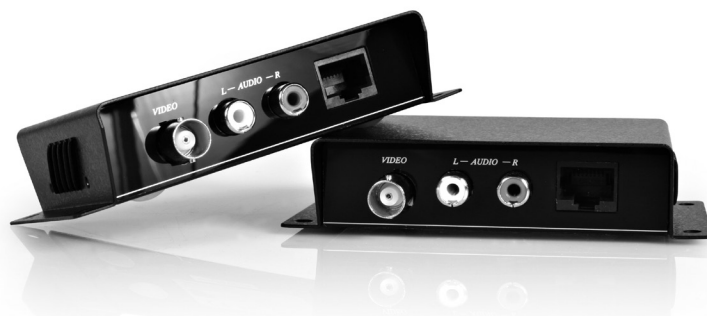
*actual product may vary from photos